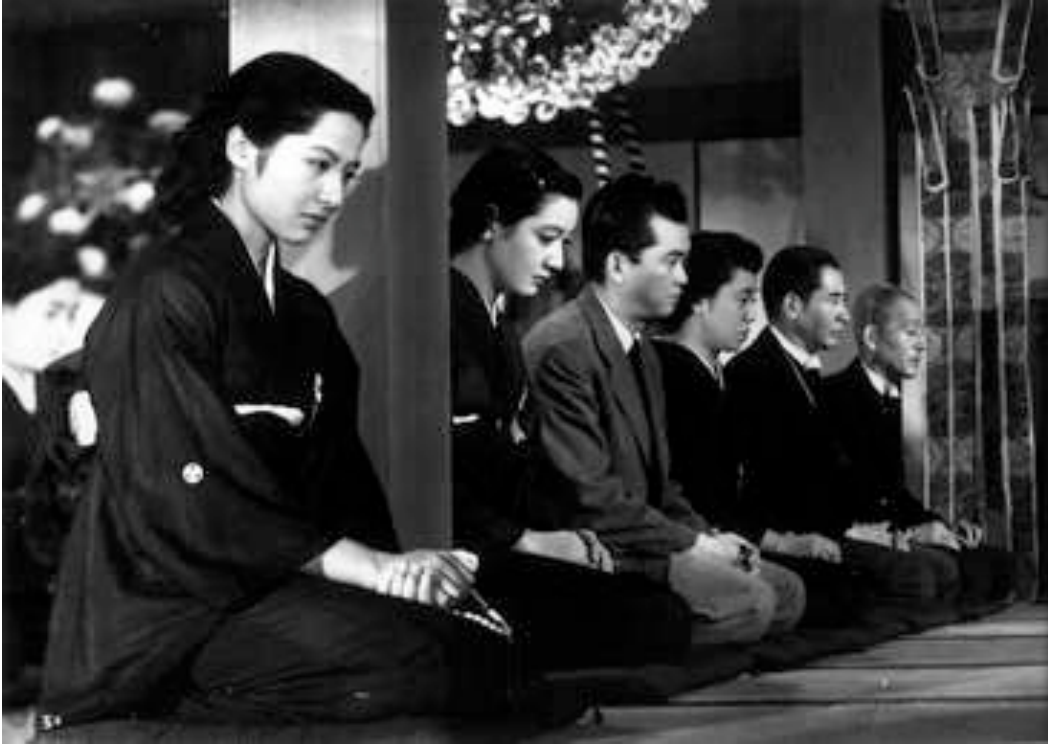
A shot from the scene of the funeral of the mother, TOMI. From left to right (foreground to background), the characters are KYOKO (youngest daughter, single), NORIKO (widow of son who died in WWII), KEISO (youngest son, single), SHIGE (eldest daughter, married), KOICHI (eldest son, married), SHUKICHI (father, widower of Tomi).